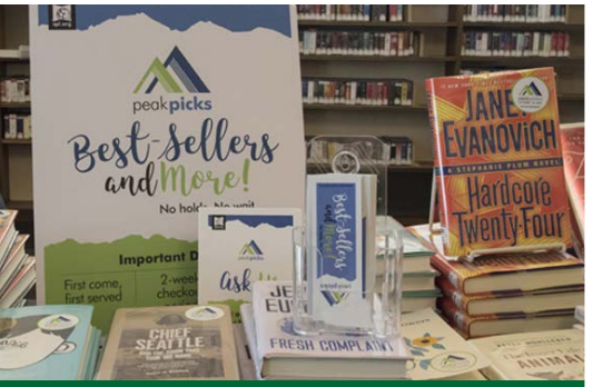
COLLECTIONS = QUALITY